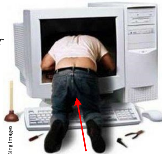
Jim Ullom's better half.

Please join us at the Regional Center, 4801 Springfield Street (about a mile west of the Air Force Museum). Bring a friend—all DMA meetings are free and open to the public. There's plenty of free parking, and the Center is accessible via RTA bus route 11. The building is handicapped accessible. Click here for a map. Afterward, join us for a meeting of the Pizza SIG at Donato's at 5600 Airway Road. Click here for a map.