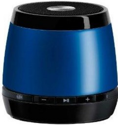
JAM Wireless Speaker

um-ion rechargeable battery provides up to four hours of wireless play — no need to buy batteries; simple on/off switch on the bottom of the unit.