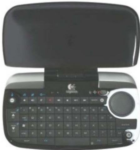
Also nice in my living room (think Netflix): Logitech diNovo Mini Black 63 Normal Keys Bluetooth Wireless Mini keyboard Item#: N82E16823126039 $120, pictured to the left.

Any paid-up DMA member is entitled to a business card-sized advertisement free in every issue of THE DATABUS. Patronize our advertisers, and be sure to tell them that you saw their ads here! Click anywhere on the advertisements to go to the advertiser's Web site.