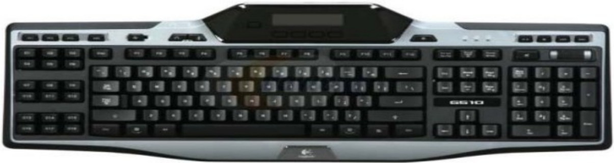
Pictured above: Logitech G510, NewEgg Item#: N82E16823126100 $106.

There are several programmable keyboards. One or two really are 100% programmable. There are even some that you just place the key switches wherever you want on a slate. But I don't want them badly enough to pay $1500!